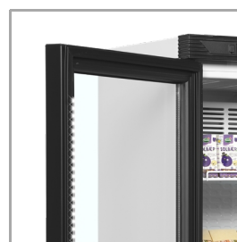
LED light inside door frame