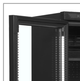
LED light inside door frame