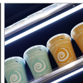
LED light under each shelf