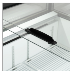
Sliding glass lids