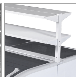
Promotional shelves as accessory