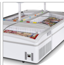
Island installation, shelves as accessory