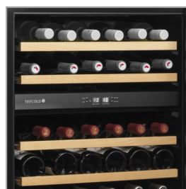
Wooden drawing shelves