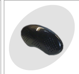
Charcoal filter included