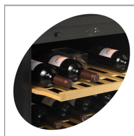
Wooden drawing shelves