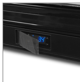
Protective thermostat cover