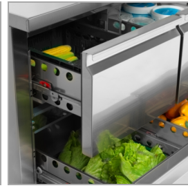
Drawers available as seperate kit