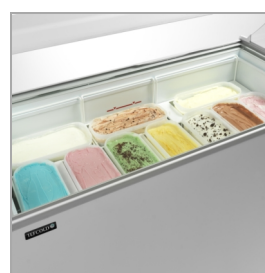
Scooping basket option