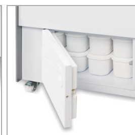
Easy access storage compartment