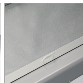
Rear night curtain to maintain temperature