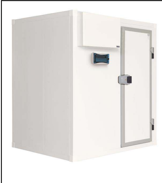
102119 (CRF2428SG20N) Cold/Freezer Room 2830x2430 th.100mm, split Unit