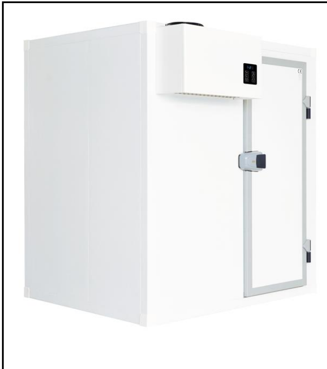
102086 (CRF2424B20N) Cold/Freezer Room 2430x2430 th.100mm, included Unit